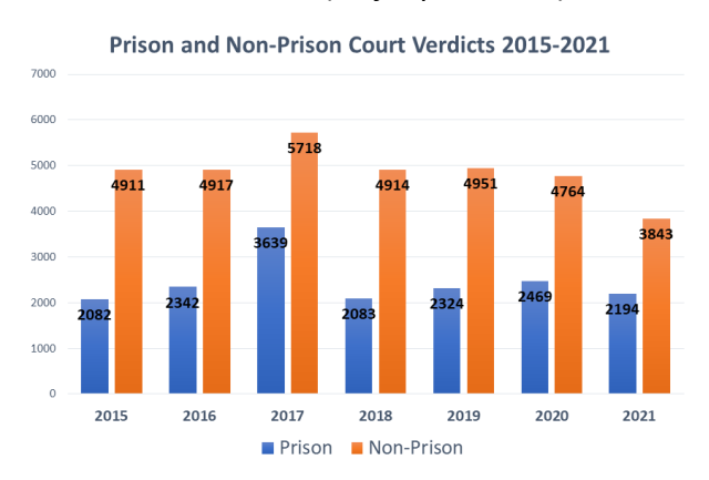
Figure 2. Diagram of Decisions After the SPPA Law is Effective (Dirjenpas, 2022)

After that, from 2015 to 2021, the verdicts on non-prison sentences in Indonesia were always higher than the prison sentences. Figure 2 illustrates that non-prison sentences increased after the SPPA Law became effective. In 2015, the number of children sentenced to prison