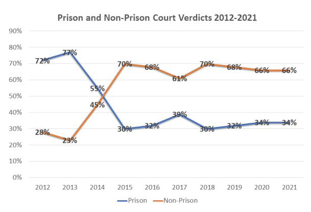
Figure 3 shows that from 2012 to 2013, the percentage of juvenile criminals imprisoned was very high, namely 72% to 77%. However, in 2014 the number of juveniles who obtained non-prison judgments nearly doubled from 23% to 45% last year. After that, from 2015 to 2021, non-prison penalties in Indonesia were consistently past 60% of the total judgments. The highest percentage of non-

Figure 3. Prison and Non-Prison sentence diagrams for 2012-2021 (Dirjenpas, 2022)